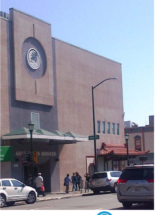
Figure 3. AHS 835 Webster Clinic

A provider developed and conducts initial training sessions on various topics for MA health coaches and other staff. The format for these sessions has included didactic and participatory methods, including an online module and a Jeopardy-style game. To date, modules have been conducted during a monthly meeting. Trainings have entailed a